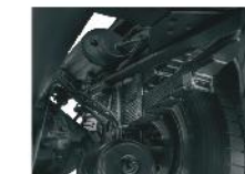
Heavy duty semi-elliptical leaf springs for higher life