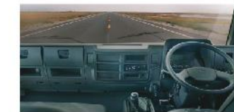
Refreshed dashboard with lockable and open storage spaces