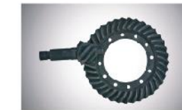
Heavy-duty crown wheel pinion with 458 mm crown diameter