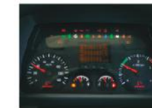
Instrument cluster with LCD display