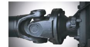
Lubricated for life propeller shaft