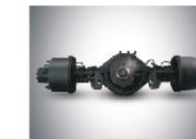
Heavy duty rear axle