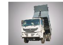
Single piece metallic bumper