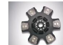
395 dia clutch with clutch booster