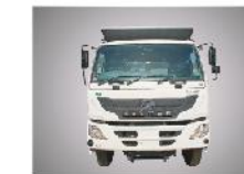
Iconic pegasus styling for uniform family look