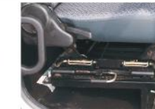
6 way adjustable driver seat