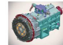
Proven Eicher 6-speed transmission