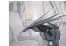
Tilt and telescopic power steering