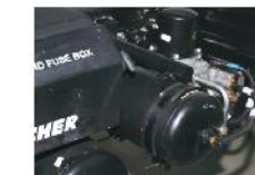
Advanced APDA with 10 bar system for safer braking