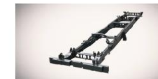
Straight frame domex chassis with high tensile strength