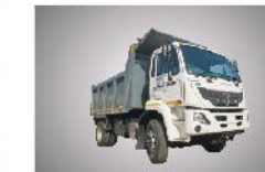
Dual footstep with grab handle for easy climbing